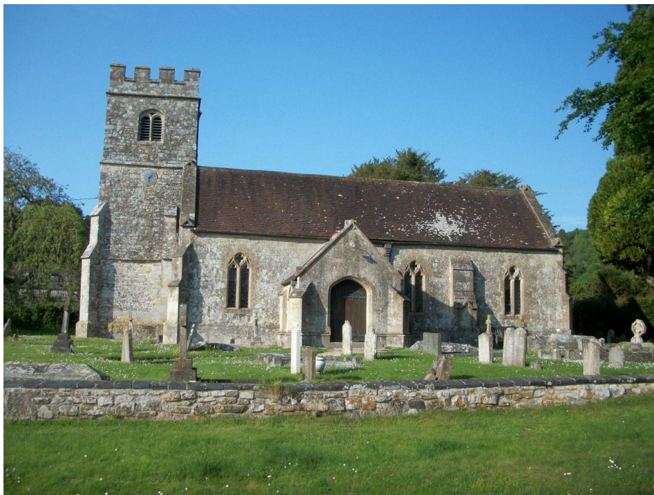
St Mary's Churchyard, Codford, Wiltshire