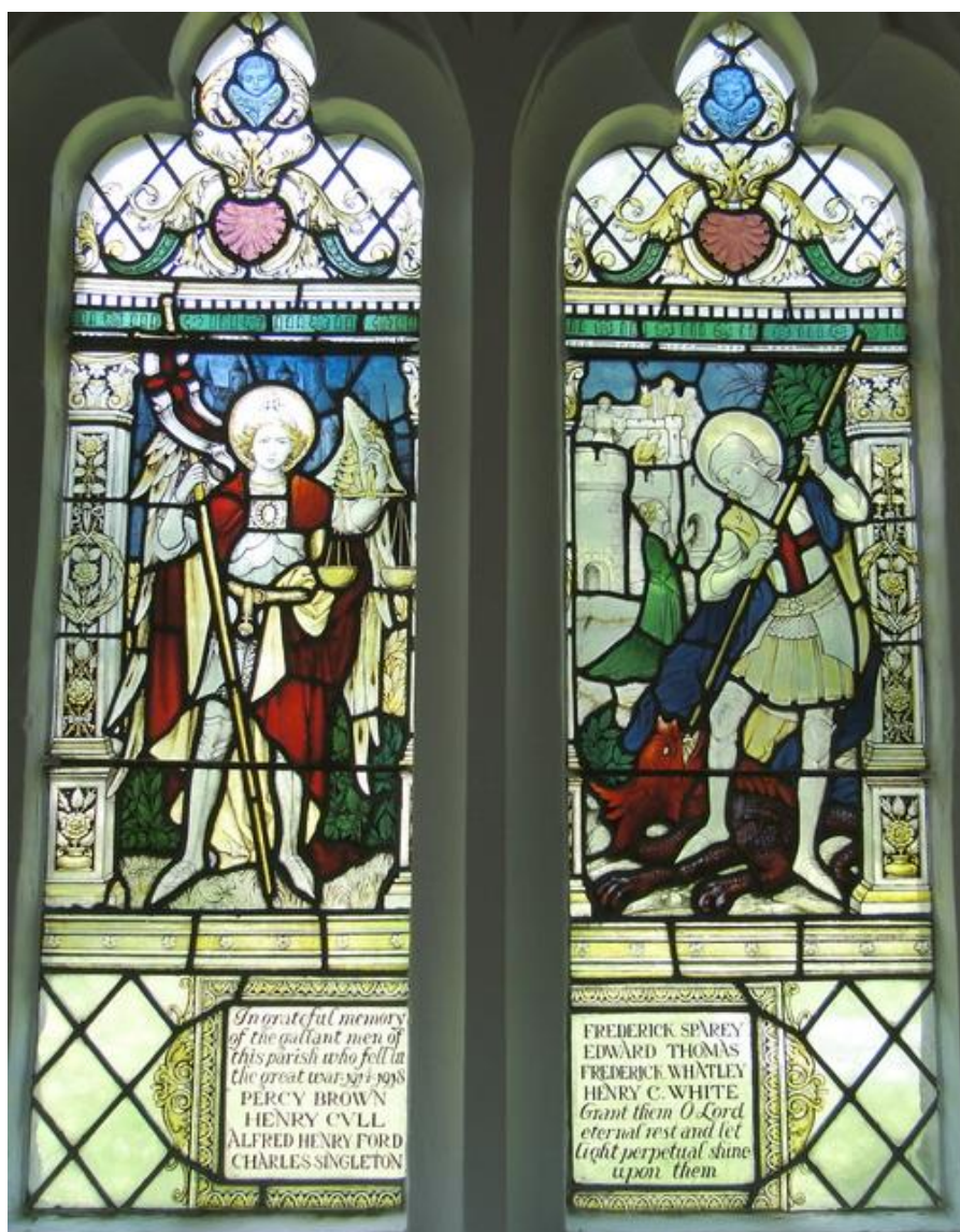
Codford St Peter War Memorial window with Saints Michael and George