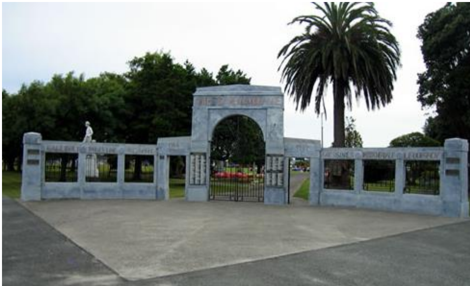
Westport War Memorial