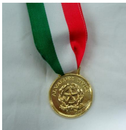
Medaglia Civile Di Valori