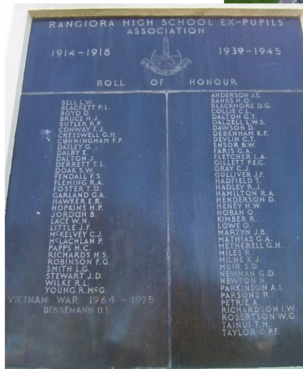
Rangiora High School Memorial