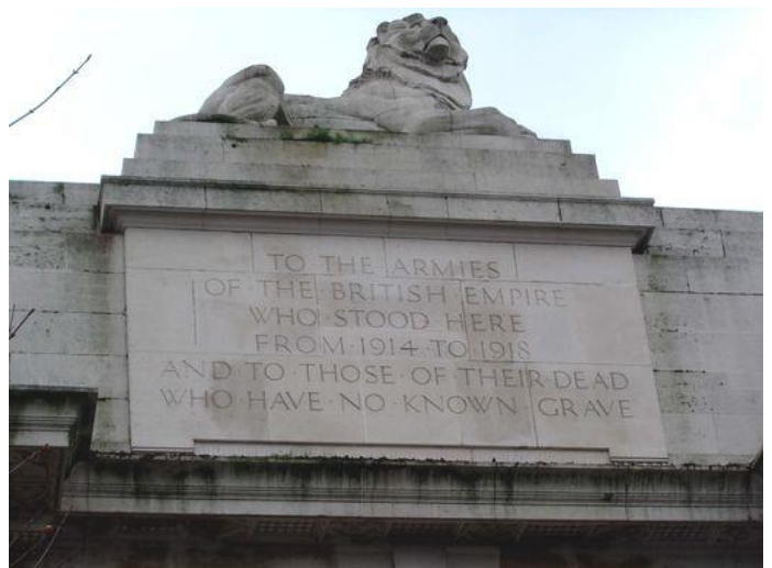
Ypres (Menin Gate) Memorial