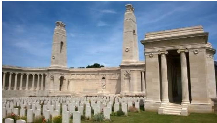
Vis-en-Artois Memorial, Pas-de-Calais, France