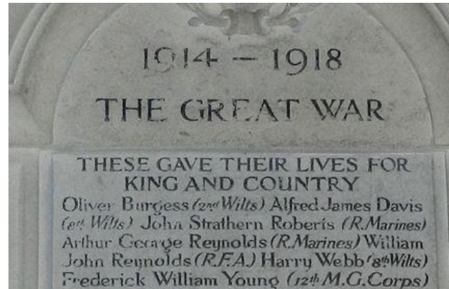
← All Saints Roll of Honour Plaque, Great Chalfield