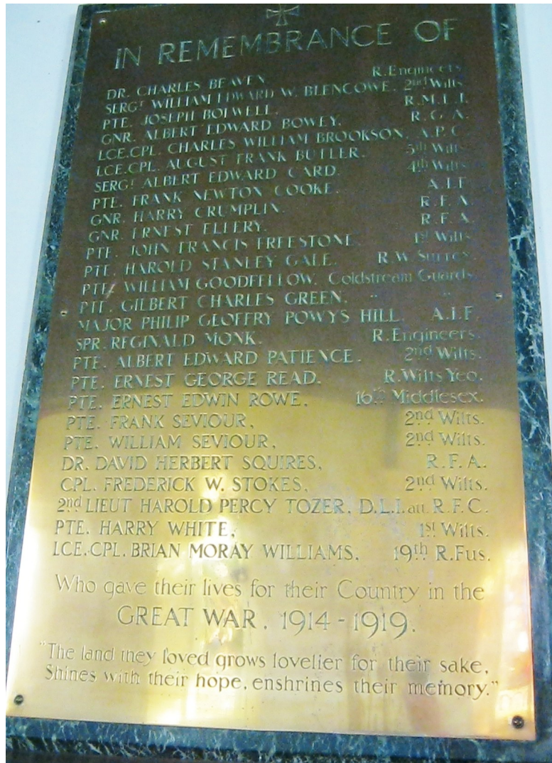
This plaque is in All Saints Church East Harnham.

The names displayed all have a connection with the area, however tenuous.