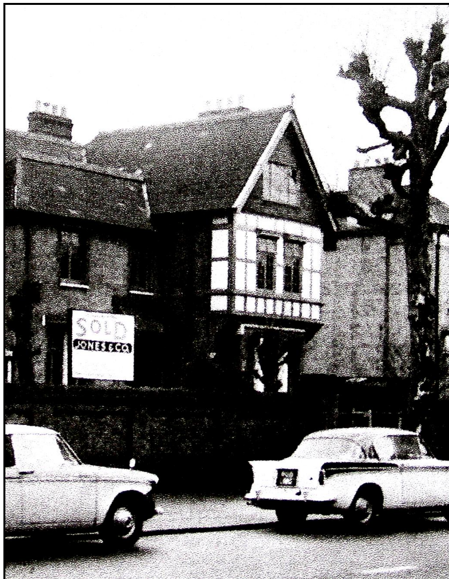
Bolingbroke was sold in about 1960, following Emily Marion Pocock's death in 1959 10