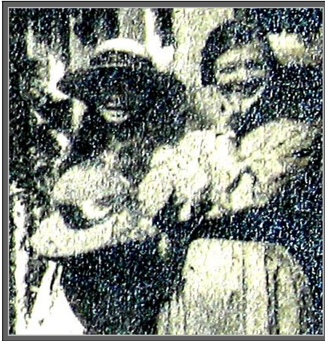
Two young women from the right of the picture (above). Who are they? What became of their lives?