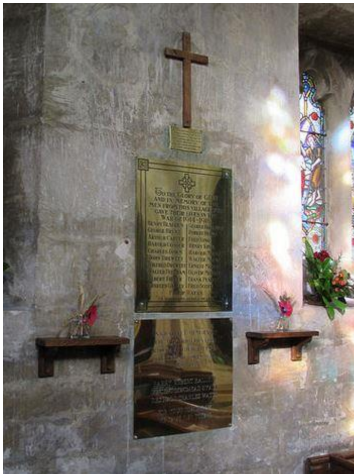
Bratton - Church of St. James - Roll of Honour Plaques