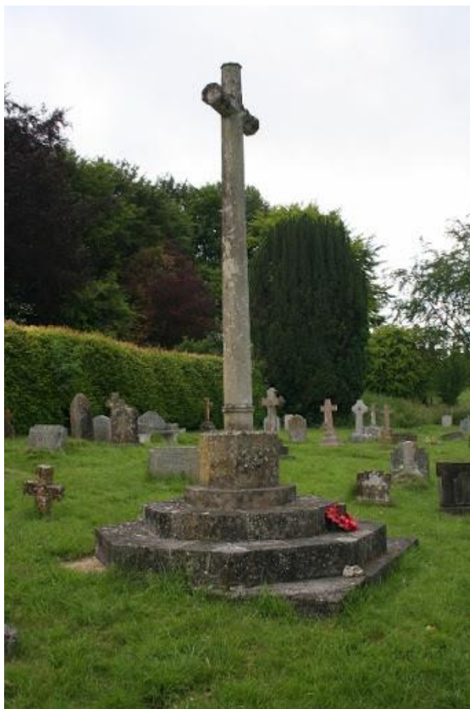
Boyton and Corton War Memorial

(Information kindly supplied by Parish Clerk of Boyton and Corton)