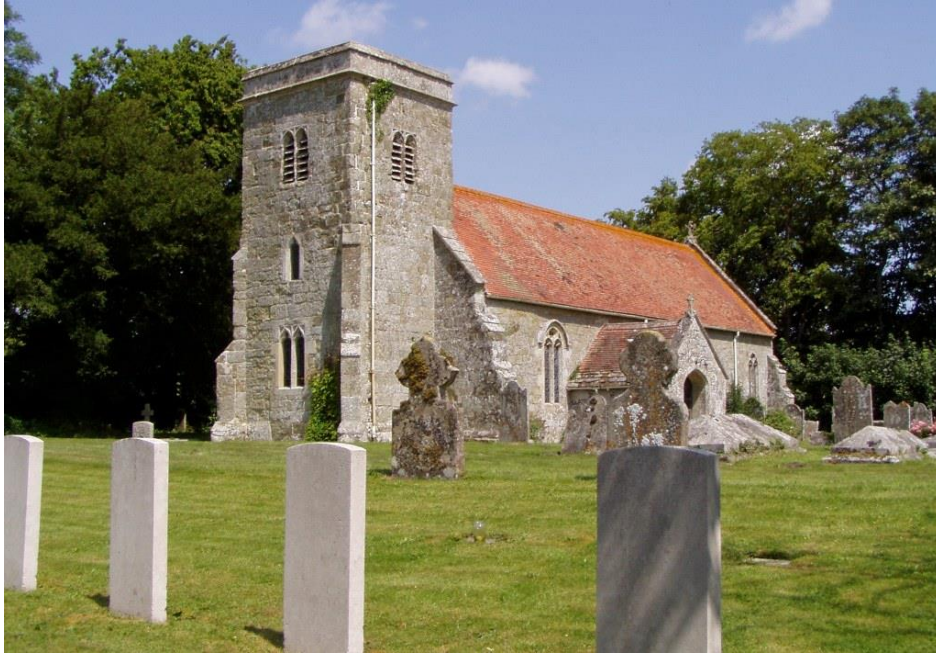
St. Edith's Churchyard, Baverstock, Wiltshire.