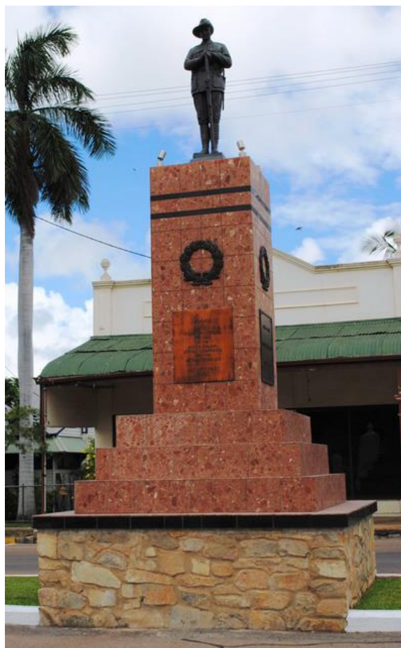
Charters Towers War Memorial Cenotaph

Charters Towers War Memorial Cenotaph, located on Gill Street, Charters Towers, does not have individual names listed.