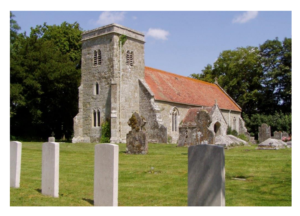
St. Edith's Churchyard, Baverstock, Wiltshire.