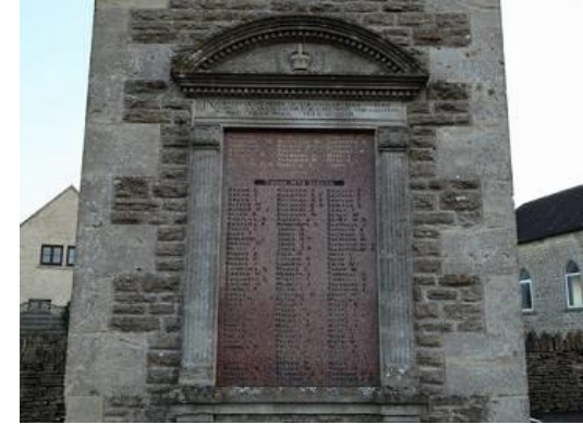
Atworth Clock Tower Memorial