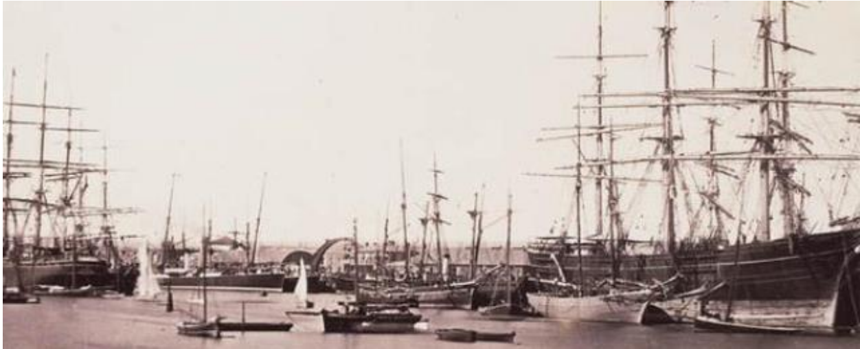
Port Adelaide, South Australia c1855